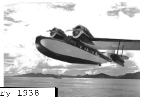
Captain Sharp ferries visitors to and from Rura-Tonga aboard his Grumman seaplane.

Advertisement from World Traveler Magazine, February 1938