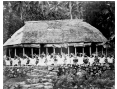
Rura-Tonga's natives provide an authentic slice of island life and local custom.