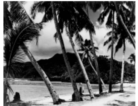
The island's beaches, jungles, and mountains offer a tropical refuge from the busy world.

V ISITORS ARRIVE at Rura-Tonga's main dock, a small pier jutting out into the calm lagoon waters. Floatplanes and boats from larger ships can find safe harbor here. Occasionally a private yacht or touring sailboat make port and shelter in the lagoon. The dock leads to the intersection of the town's two streets, both dirt roads. Gauthier Street follows the coastline and contains bungalows for residents, each overlooking the lagoon. The road turns into a path and continues along the beach to Chateau Gauthier, a luxury bungalow on a small estate, home to Gaston Gauthier, Rura-Tonga's most illustrious resident.